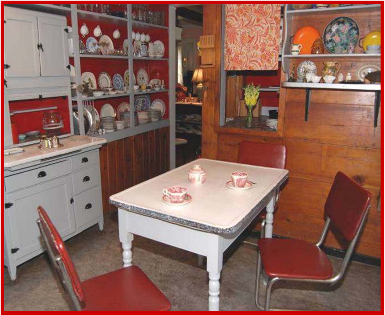
The kitchen table from Clinton Street where Ebby and Bill sat in November 1934 for that momentous meeting which changed all our lives... (Currently at Stepping Stones)